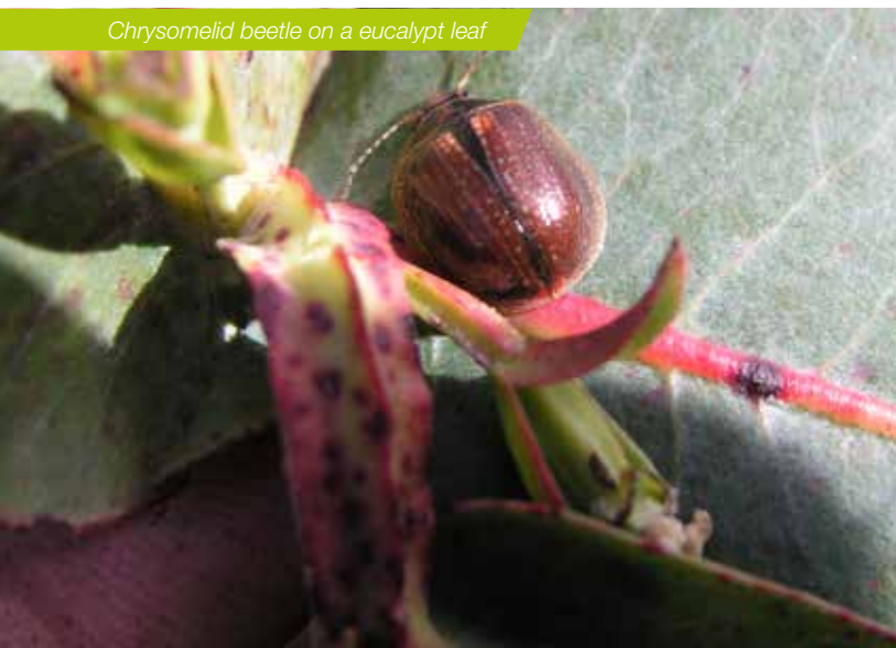
Chrysomelid beetle on a eucalypt leaf